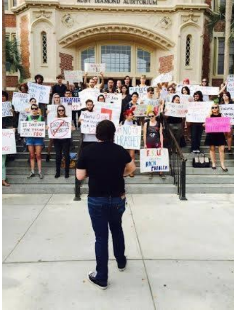
FSU students protest against Koch influence on campus and the controversial appointment of FSU's new president

In March 2017, the faculty senate at Wake Forest University in North Carolina passed a motion that WFU cut any ties with Koch and his network of political donors. The motion was based on reports from two faculty senate committees.