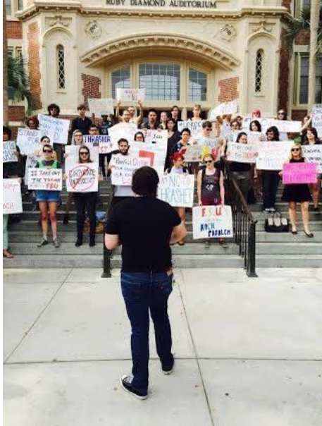
FSU students protest against Koch influence on campus and the controversial appointment of FSU's new president

In March 2017, the faculty senate at Wake Forest University in North Carolina passed a motion that WFU cut any ties with Koch and his network of political donors. The motion was based on reports from two faculty senate committees.